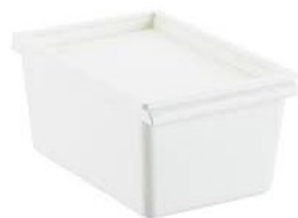
Labelled, clean masks returned