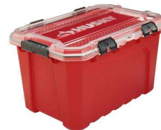
Labelled, used masks released to TSS